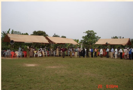
Outdoor evangelistic meetings are a crucial element of the church-planting program