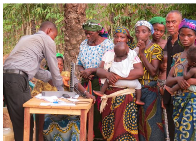
Medical Clinic in Ndiagu Eze Eziulo, Nigeria

In addition to this experience, the children will be saving their money to support our African medical clinics. CWM provides a 2-3 day clinic in each village where we plant a church. This means hiring an indigenous doctor and providing the medical supplies and medicine needed. Each clinic sees hundreds of patients a day. So thanks in advance to the children and their families of FUMC Starkville for sharing the love of Christ in this manner.