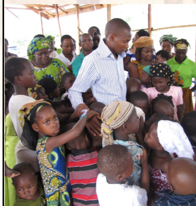
A young pastor and the children of his new church, Nigeria.