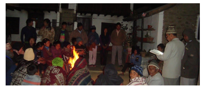
Believers gathered for intercessory prayer & praise in Eastern Nepal

As news of the devastating earthquake in Nepal reached us we began to pray about how we could help. With generosity from 1st United Methodist in Starkville, and many others, we were able to fund repairs for several homes and churches. Continue to pray for that small, vibrant country — Christians are facing great persecution now as the country votes to establish its first constitution since becoming a democracy in 2008. In order to hinder conversion, the Hindu government is campaigning to prohibit any public gathering of Christians, even for Sunday services. Persecution is spreading, but Christians are standing firm. Read about how you can pray for the Nepalese people now inside this issue.