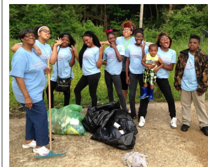
Cleaning up the neighborhood

Sometimes, people, events, and circumstances all converge to make God's plan