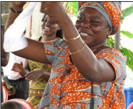
Worship at new church at Kokoso, Ghana

Each night during the evangelistic crusades, our US team worshipped with the local people, preached the gospel through an interpreter, gave an invitation for salvation (or turned it over to the indigenous pastors for the invitation) and prayed for the sick. The style of the services was usually different from the way we worship at home, but we found great freedom and joy in worshipping the Lord through dance and music unique to the area. The people who came to Christ each night became the congregation for the new church. It gave us great pleasure to see these new Christians unite with their recently commissioned pastor to form this new church that would be a dwelling place for the presence of God and the proclamation of His Word for years to come. Some of the new churches met in school rooms, some under a borrowed or rented pavilion, but all worshipped with enthusiasm, seeking the Lord for strength in their new journey with Him.