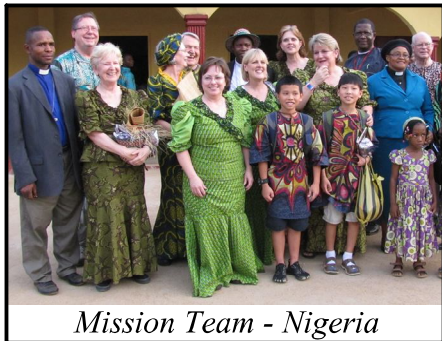
Mission Team - Nigeria

This year, in Ghana, we had the opportunity to visit several churches that were planted by CWM 15 years ago. What a blessing! At Ebenezer Methodist Church, the pastor greeted us with these powerful words, "We decided to name the church Ebenezer, which means 'look how far the Lord has brought us.' We named the church in honor of your ministry, because without your ministry, our church would not be what it is today." This kind of encouragement from the Body of Christ certainly helps us to keep planting seeds and growing churches.