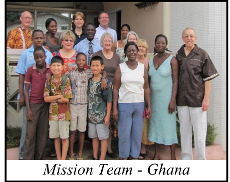
Mission Team - Ghana

Each of our Africa missions follows a similar schedule. Our staff begins by visiting previously planted churches in Ghana. The following weekend, we are joined by a US team to plant 10 new churches in another area of the country. Our staff then travels to Nigeria along with any of the other team members who are working in both Ghana and Nigeria. Another US team joins us there to plant 10 new churches in Nigeria. We have a wonderful celebration service at the end of the missions and the US team heads back home, tired but full of God's glory. Then the CWM staff visits previously planted churches in Nigeria. It is a wonderful way to see what God has done and be encouraged by all that He is continuing to do.