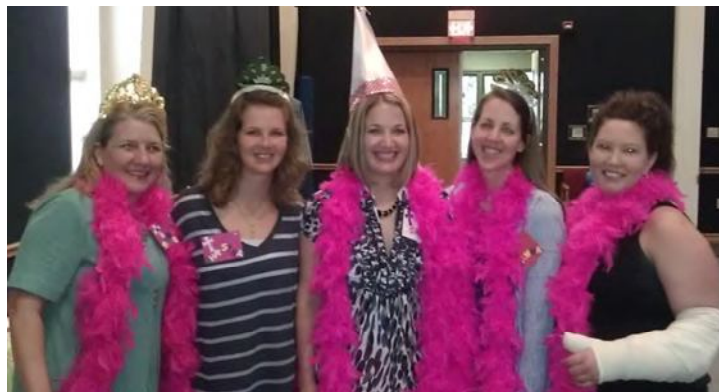
Some of our friends who attended the Lee's Summit, MO FaithLift. Truly daughters of the King.

Thanks to all who gave of their time and talents to make it happen!