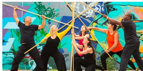
July 7-9, Movement in Worship Conference at The Storehouse at CWM, Starkville See their website for more info about them:

www.miw.org.uk Call 662-324-0390 or visit www.ChristianWorldMissions.org for conference info