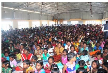
Vacation Bible School, India, May 1

I don't know what you're facing, but I know this: If you will reach out to God, He will hold you and give you peace. He will not let you be destroyed or overwhelmed. Your feelings may betray you sometimes, but He will always be faithful to hold you. Don't give up! Just stand on your tiptoes and cry out for help! He will restore your peace and your hope!