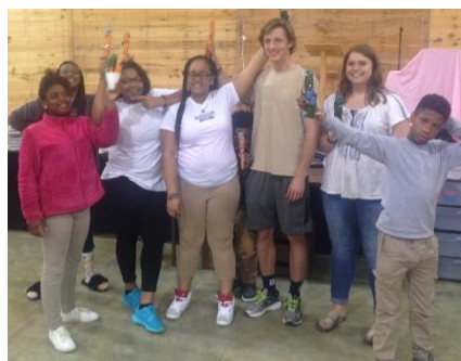
YCE kids having fun with food