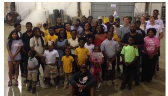
Youth Community Explosion, Starkville, Making a Difference in other kids' lives!