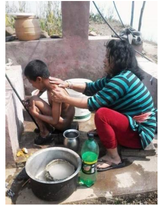
Bathing an orphan boy in Nepal, April